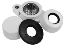
Thermoplastic (White or Black)