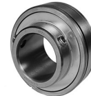
SSER Setscrew Cylindrical O.D.