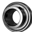
SSB Setscrew Narrow Inner Ring