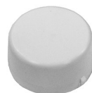
Closed Cover (CL)*