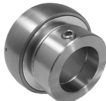
SHC Eccentric Wide Inner Ring