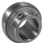
SUC Setscrew Wide Inner Ring

*All Stainless Inserts Unless Otherwise Noted