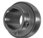
CUC Setscrew* Thin Dense Chrome (TDC)