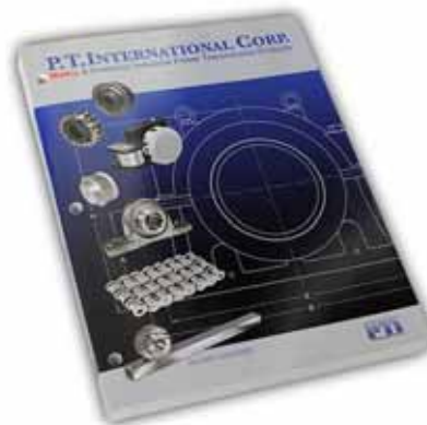
PTI 2010 Catalog