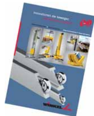
WINKEL 2009 Catalog